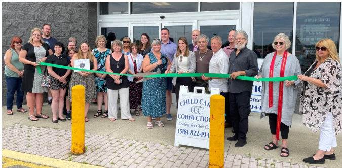
Greene County Ribbon cutting