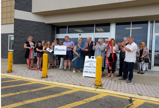
Columbia County Ribbon cutting